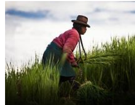
Agrobiodiversity in mountain areas