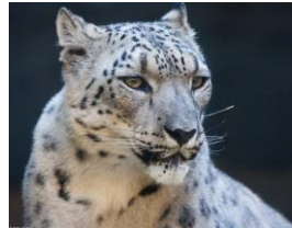
Mountain conservation in Nepal

Understanding the effects of transformation processes, such as climate change and the change of coverage and use of land, over biodiversity and ecosystem services in mountains, at different altitudes is the key to informed decision