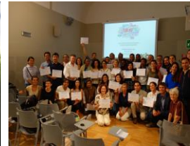
Sustainable bioeconomy in the Mountains

The Mountain Partnership Secretariat, in collaboration with the Sapienza University of Rome, Bioversity International and the Food and Agriculture Organization of the United Nations (FAO) has just launched the Summer School titled "Agrobiodiversity in a