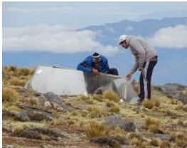
Andean monitoring systems in Colombia

Understanding the effects of transformation processes, such as climate change and the change of coverage and use of land, over biodiversity and ecosystem services in mountains, at different altitudes is the key to informed decision